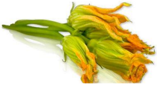
Squash blossoms, an underutilized vegetable. Eating them is a great way to control your squash crop.

Some herbs make a nice addition to your pet's diet. Contrary to the old wive's tale, cilantro does not contribute to bacterial infections, and, since it is high in vitamin C, can be give a couple of times a week. Fresh basil, sage, oregano, and thyme can add some spice to their dinner, too. Offering small amounts is important as some of the essential oils in the herbs can be a bit strong for some animals.