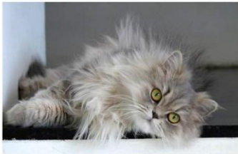
Longer haired breeds of cats are more at risk of getting hairballs, although any cat can develop them.

As cats groom themselves, their tongue catches loose hairs that they swallow. These hairs normally pass through their system with no problem, but they can begin to collect in the stomach. The only way for a cat to get rid of these masses of hair is to throw them up. The swallowed hair can also begin to impact on their intestines, causing a negative feedback loop: this impacted hair triggers more shedding (since the body thinks there's too much hair around), and then as they groom, they swallow more hair, increasing impaction and increasing the risk of hairballs.