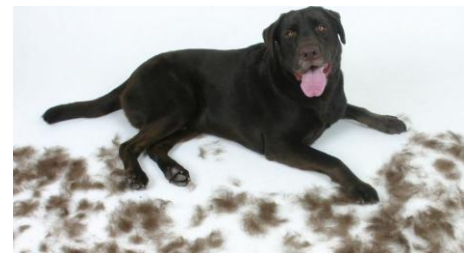
Shedding doesn't need to be so bad; it can be controlled with enzymes.

Enzymes begin to break this vicious, negative feedback loop